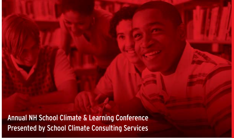
Annual NH School Climate & Learning Conference Presented by School Climate Consulting Services