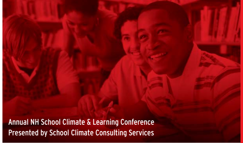
Annual NH School Climate & Learning Conference Presented by School Climate Consulting Services