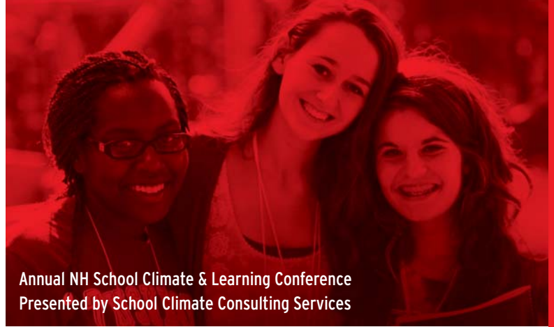
Annual NH School Climate & Learning Conference Presented by School Climate Consulting Services

SEL: WHY IT MATTERS IN DISCIPLINE, CURRICULUM, INSTRUCTION, AND ASSESSMENT!